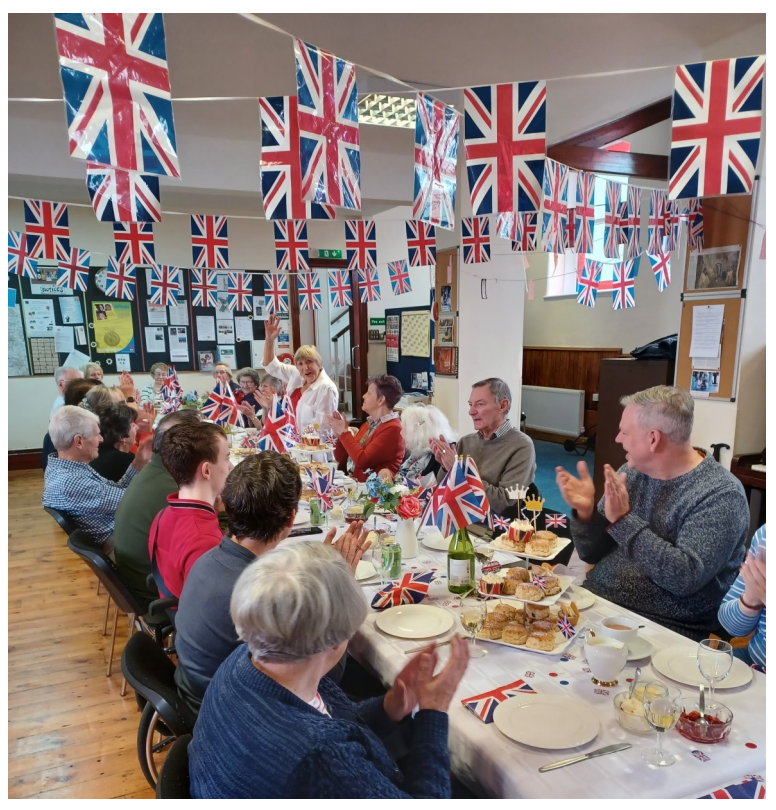
Cheers to King Charles III, Queen Camilla